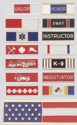
J201 shown actual size (1 3/8" x 3/8")