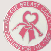
15/16" - A12102 11/16" - A12103