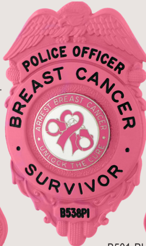
B538-PI 3" x 1 7/8" $87.00