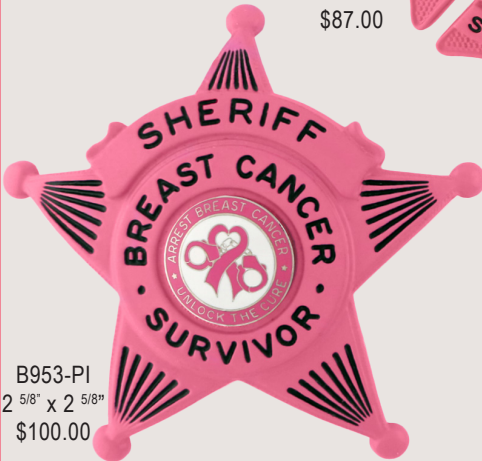
B953-PI 2 5/8" x 2 5/8" $100.00