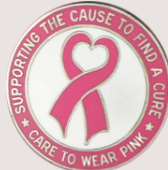
15/16" - A12098 11/16" - A12099