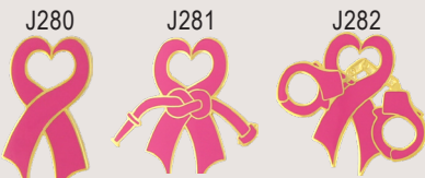
J280 J281 J282 1 1/8" Lapel pins with clutch back Sold individually in gold plate $12.90