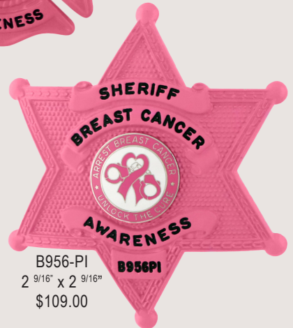
B956-PI 2 9/16" x 2 9/16" $109.00

Standard seal finish for pink badges is Rhodium (silver)