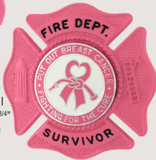
B484-PI 1 3/4" x 1 3/4" $87.00