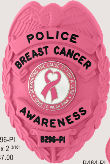
B296-PI 3 1/8" x 2 3/16" $87.00