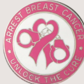
15/16" - A12100 11/16" - A12101