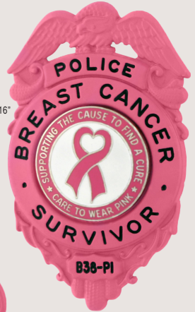
B38-PI 2 9/16" x 1 9/16" $87.00