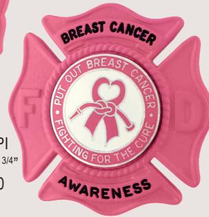
B501-PI 1 3/4" x 1 3/4" $87.00