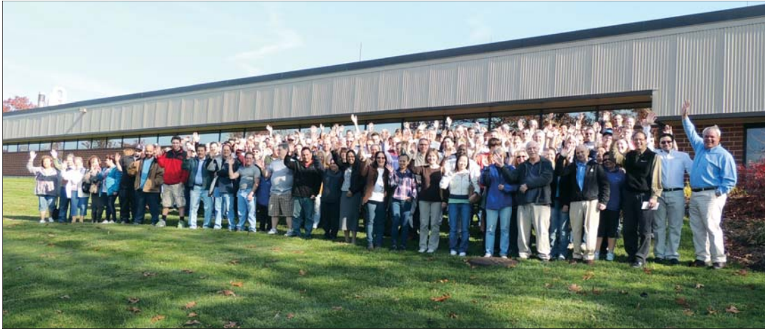
Blackinton® employee photo taken November 12, 2012, in front of the manufacturing facility.