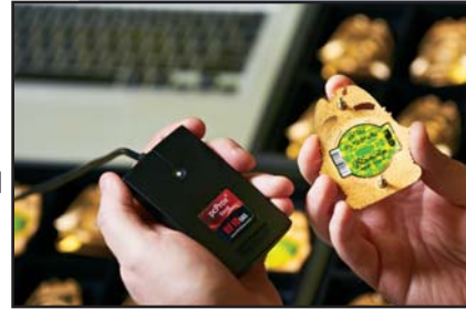
SmartShield® badge with RFID reader Patented process & parts, US7522056B2

The willingness of Blackinton® to embrace technology has helped shape the company into an industry leader, exemplified by its 2008 unveiling of SmartShield®. SmartShield® is a traditional Blackinton® metal badge with smart technology - an embedded RFID chip. This high-security U.S. patented badge solution is opening untapped markets for Blackinton®. As the company looks to the future and continues to develop and expand the SmartShield® technology one thing will always remain constant - the hand-crafted quality metal badge that holds the embedded chip.