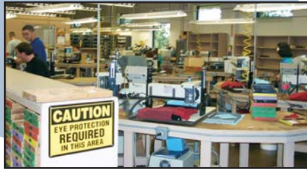
Computer controlled engraving

A walk through the Blackinton® factory is a surreal experience, exposing one to the technical advancements of the 21 st century against the nostalgia of old-world craftsmanship that put Blackinton® on the map. Badge lettering, once handled by a long row of men with hammers, is now almost exclusively done by computer controlled engraving machines. Even so, we still have one Stenciler available for intricate pieces, or simply for customers who desire the old-world look of a stenciled badge. Each badge is a personalized, unique item requiring individual attention and care. Computers and technology help design, engrave, cut, and stamp metal, but hard working dedicated employees make Blackinton® badges the unparalleled gems that they are.