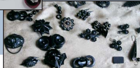
1852 glass buttons & 1857 jet jewelry