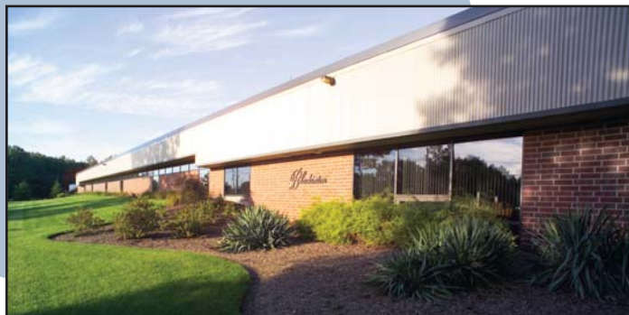
Blackinton® Facility 1982-present, 221 John Dietsch Blvd.