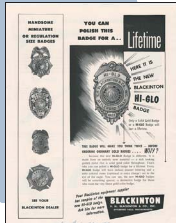
1956 Hi-Glo® ad in Police Chief Magazine

The end of the war brought a demand for identifying jewelry and insignias. The shield, a symbol of protection from the days of "knights in armor," took on added meaning as Blackinton® began to design badges and insignia for police and fire departments, a tradition that continues to this day.