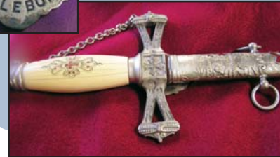
1885 constable badge & 1865 sword hilt

The end of the war brought a demand for identifying jewelry and insignias. The shield, a symbol of protection from the days of "knights in armor," took on added meaning as Blackinton® began to design badges and insignia for police and fire departments, a tradition that continues to this day.