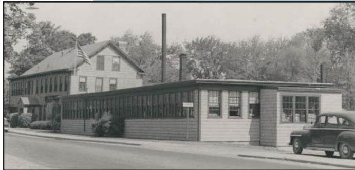
Blackinton® Facility 1857-1982, 140 Commonwealth Ave.

Versatility, creativity and a local commitment to fine craftsmanship are the values upon which Blackinton® has successfully sustained 160 years of manufacturing excellence in the United States.